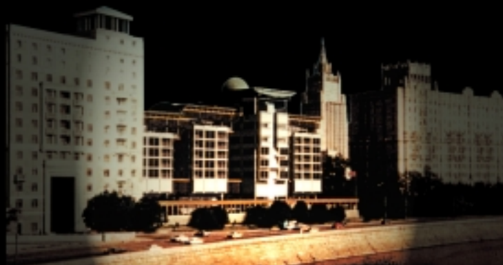
The New British Embassy, Moscow.

Plain rubber (natural or neoprene) pad and strip in a variety of plan sizes and thicknesses. Laminated rubber and steel point load bearings in a wide range of plan sizes and thicknesses. Moulded rubber dowel caps. PTFE sliding bearings for small to medium-size bridges.