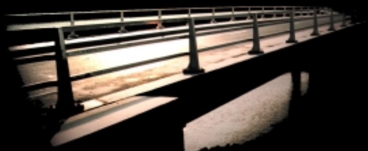
The Sonning Bridge, Berkshire, England Use of SKE laminated rubber & steel bridge bearings