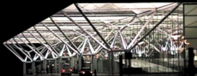
Stansted Airport, London.