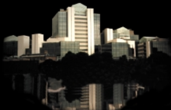
Offices and apartments adjoining the river Thames, East London Use of various bearings to accommodate structural movement