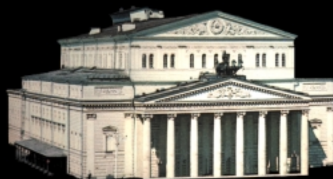
The Bolshoi Theatre, Moscow.