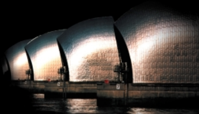
The Thames Flood Barrier, London Use of special SKS sliding bearings

Published by the Dixon International Group Ltd. The image of the British Embassy, Moscow appears courtesy of Ahrends, Burton and Koralek Architects and appears by permission of the Foreign Office (c) Hayes Davidson. The arial still of the new Number One Court at Wimbledon appears courtesy of the All England Lawn Tennis Club.