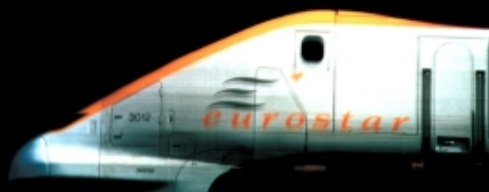
The Channel Tunnel.